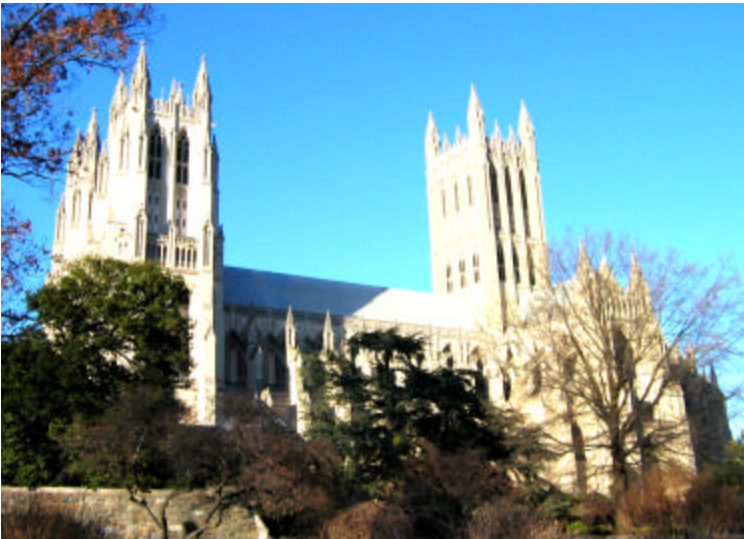
The National Cathedral in Washington, D. C.

The Washington National Cathedral is an Episcopal cathedral dedicated as the United States "National House of Prayer" of the United States. This year it is also celebrating its 100th anniversary!